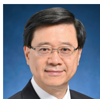
LEE Ka-chiu John GBM SBS PDSM PMSM