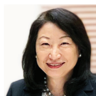
Teresa CHENG GBM GBS SC JP

Mr Xie has overseen environmental protection, resource conservation, energy saving and pollution reductions as well as climate change affairs in China. He has made major contributions to promoting co-operation on energy conservation, emission reductions and green and low-carbon development between China and over 30 countries, regions and international organisations. He is also engaged in helping train over 1,000 officials and technicians working in the field of climate change for more than 100 developing countries. He served in various positions, including Vice-Chairman of the National Development and Reform Commission, Minister of the National Environmental Protection Agency, etc. In addition, Mr Xie is the recipient of an array of major awards such as the UNEP Sasakawa Environment Prize, the World Bank Special Green Award, and the GEF Global Environmental Leadership Award.