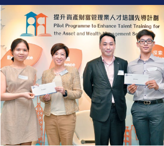
The students were all excited about the career prospects and training opportunities offered by the sector in the coming years. Some even managed to establish valuable contacts with industry practitioners for future follow up.